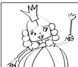
Queen of Hearts